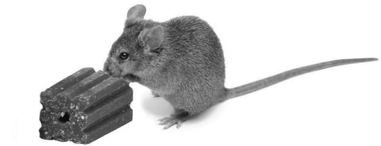
Picture not representative of Bait Placement. Bait stations are mandatory for outdoor, above ground use.