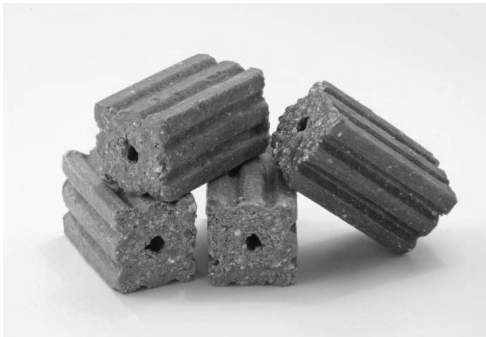
Picture not representative of Bait Placement. Bait stations are mandatory for outdoor, above ground use.